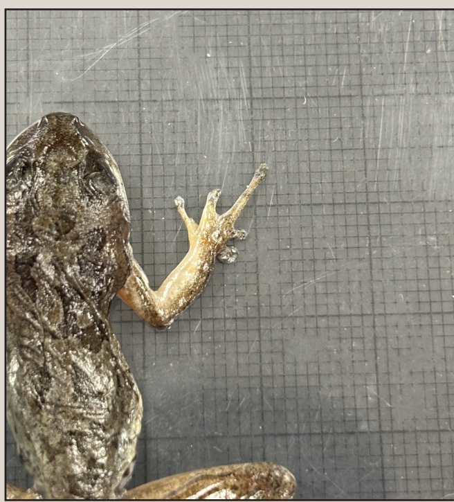
FIG. 1. Polydactylous right forelimb of a juvenile Osteopilus septentrionalis from Sarasota, Florida, USA.