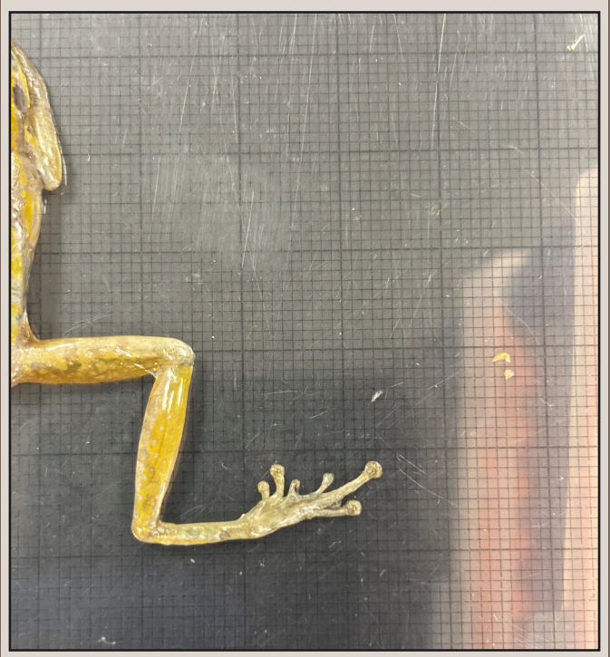
FIG. 2. Polydactylous right hindlimb of a juvenile Osteopilus septentrionalis from Sarasota, Florida, USA.

pesticides (Ouellet et al. 1997. J Wildl. Dis. 33:95–104). Polydactyly is one of the most common malformations exhibited in anuran skeletons (Svinin et al. 2020. Parasite. Vector. 13:1–11). Here, we report the observation of two Osteopilus septentrionalis that expressed various forms of polydactyly and were collected from a disturbed, urban location.