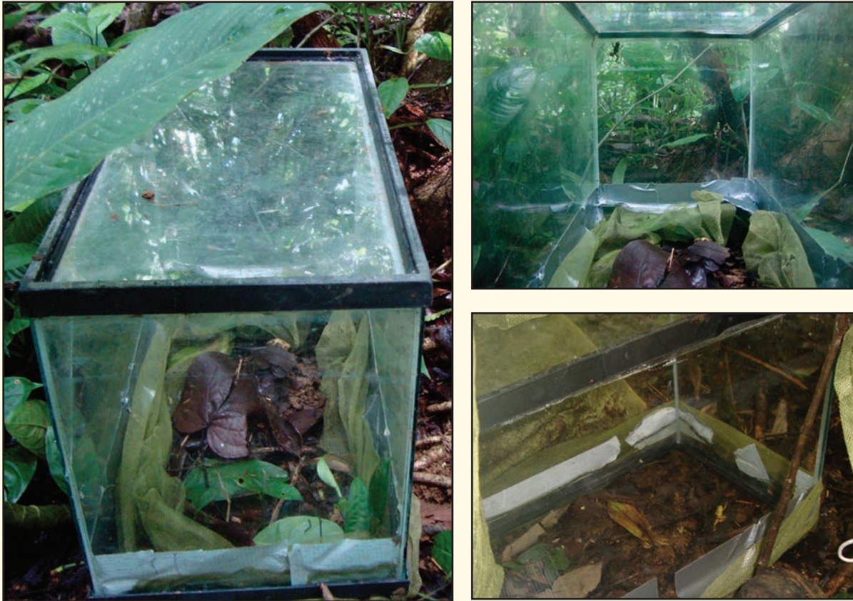
Fig. 2. The sampling aquarium I used to contain the frogs and help induce agonistic interactions. The green mesh along the bottom edge prevented the frogs from escaping.

In previous research, Meuche et al. (2012) indicated a latency of up to 3 min for the observed interactions to take place, and thus I allowed a total observation time of at least 10 min in my experiment. If I did not observe agonistic behavior from either individual after 10 min, I concluded there was no interaction and released both frogs.