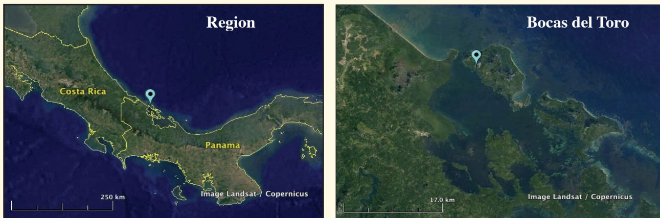
Fig. 1. Location of the Institute for Tropical Ecology and Conservation in Bocas del Toro, Provincia de Bocas del Toro, Panama. All data collection was conducted in lowland rainforest in the vicinity of the station.

I conducted daily observations from 0900 to 1100 h and from 1300 to 1600 h, from 29 July to 8 August 2013, and from 1 July to 12 August 2014, for a total of 42 days of sampling. I chose the above-mentioned observation times to ensure the sampling occurred when the frogs were most active in their territories (Haase and Pröhl, 2002; Pröhl, 2002; Bee, 2003).